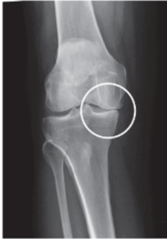
Knee OA without bracing (bone-on-bone contact)