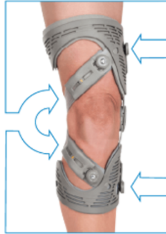
The 3-Point Leverage System