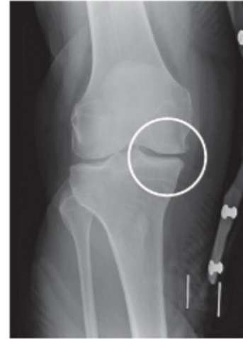
Knee OA with bracing (space created between bones)