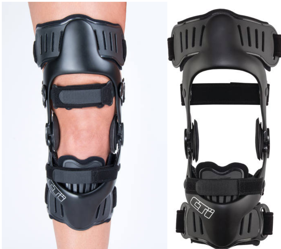
Custom CTi Knee Brace